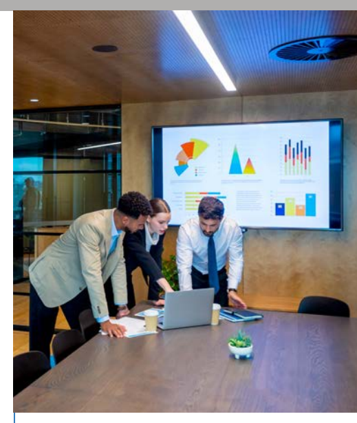
Our apprenticeships available to Hampshire County Council staff

After this stage, the learner will receive a final grade of either a pass, merit or distinction.